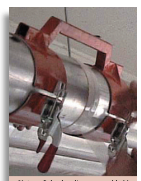
Unique Colombo alignment tool holds aluminum conduit in place while high strength 3M<sup>™</sup> VHB<sup>™</sup> Double Coated Foam Tape is applied to bond and seal the seam.

Structural Join samples withstood an average 574.7 pounds of pull