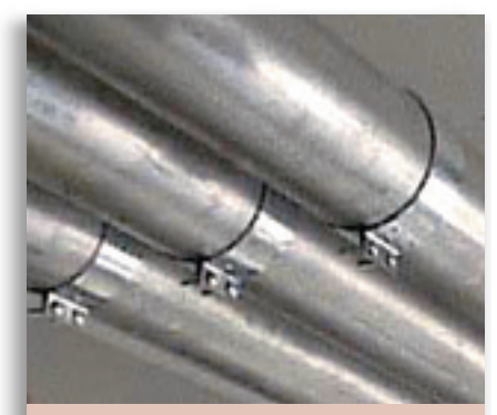
Colombo BeverageChase® System is smooth inside for easy pull through. Joint strength holds the weight of multiple lines and withstands pull-through stresses.

Glacier Design Systems, Inc. is a distributor/installer for beverage systems with headquarters in Garden Grove, CA. Scott Clarkson, President, compares the Colombo BeverageChase to installation of PVC chase and concludes, "With PVC we used a 2-part epoxy that was